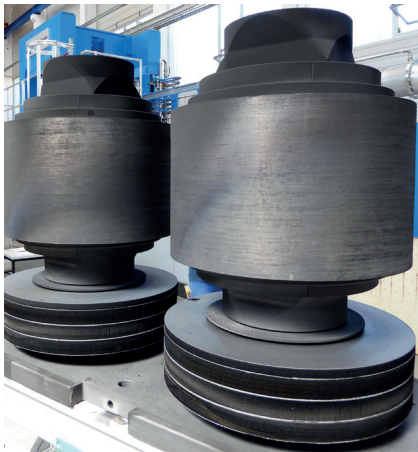
Fig. 5 Pair of pressing tools, handled simultaneously