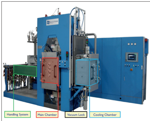
Fig. 2 FAST/SPS sintering furnace, equipped with a separate cooling chamber

rent. These so-called Field Assisted Sintering (FAST) methods (e.g. FAST/SPS, FAST/Hybrid, FAST/Flash) allow a significant reduction of the heating period due to the increase of heating rates and thermal homogeneity [1]. Also, the lengthy cooling can be accelerated by FAST, due to additional degrees of freedom in the pressing tool and furnace design.