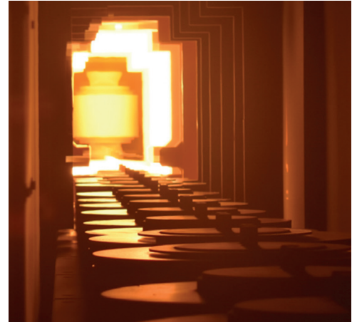
Fig. 7 View into the preheating tunnel and main chamber

hot presses as well as the above mentioned rapid FAST methods [3]. Especially in case of the latter frequently the cooling time is significantly longer than the heating and densification period.