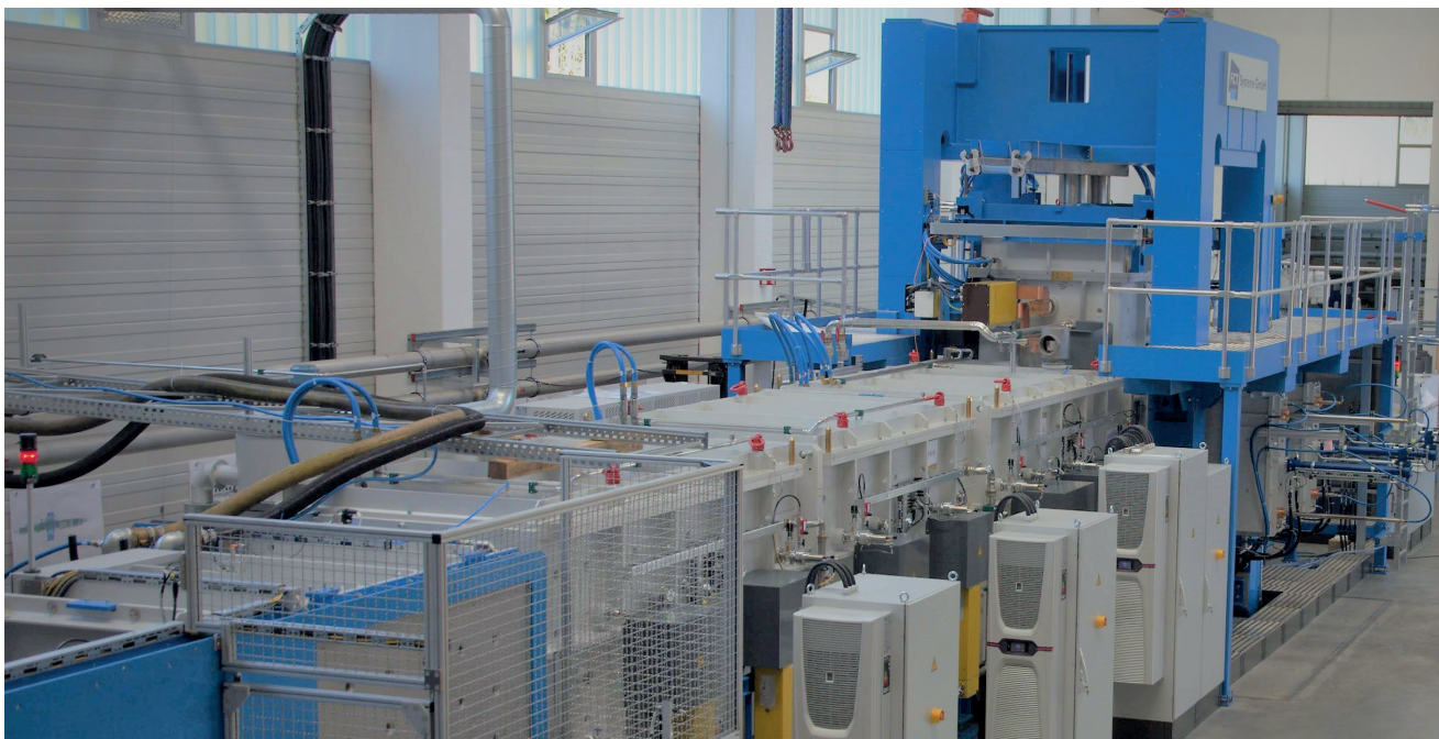
Fig. 4 Serial production line for hot pressing of large area ceramic components