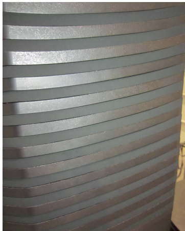
Fig. 6 Stack of 14 ceramic tiles and separation plates